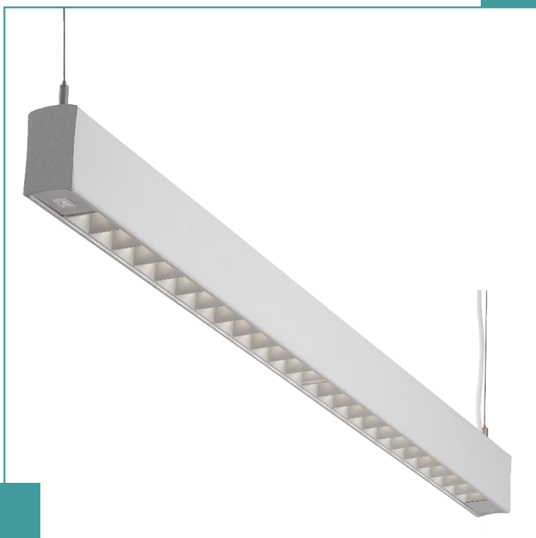
MILLI S DP VIT 4K SENS BT

IN ACCORDANCE WITH ISO 14025:2006 & EN 15804:2012+A2:2019/AC:2021